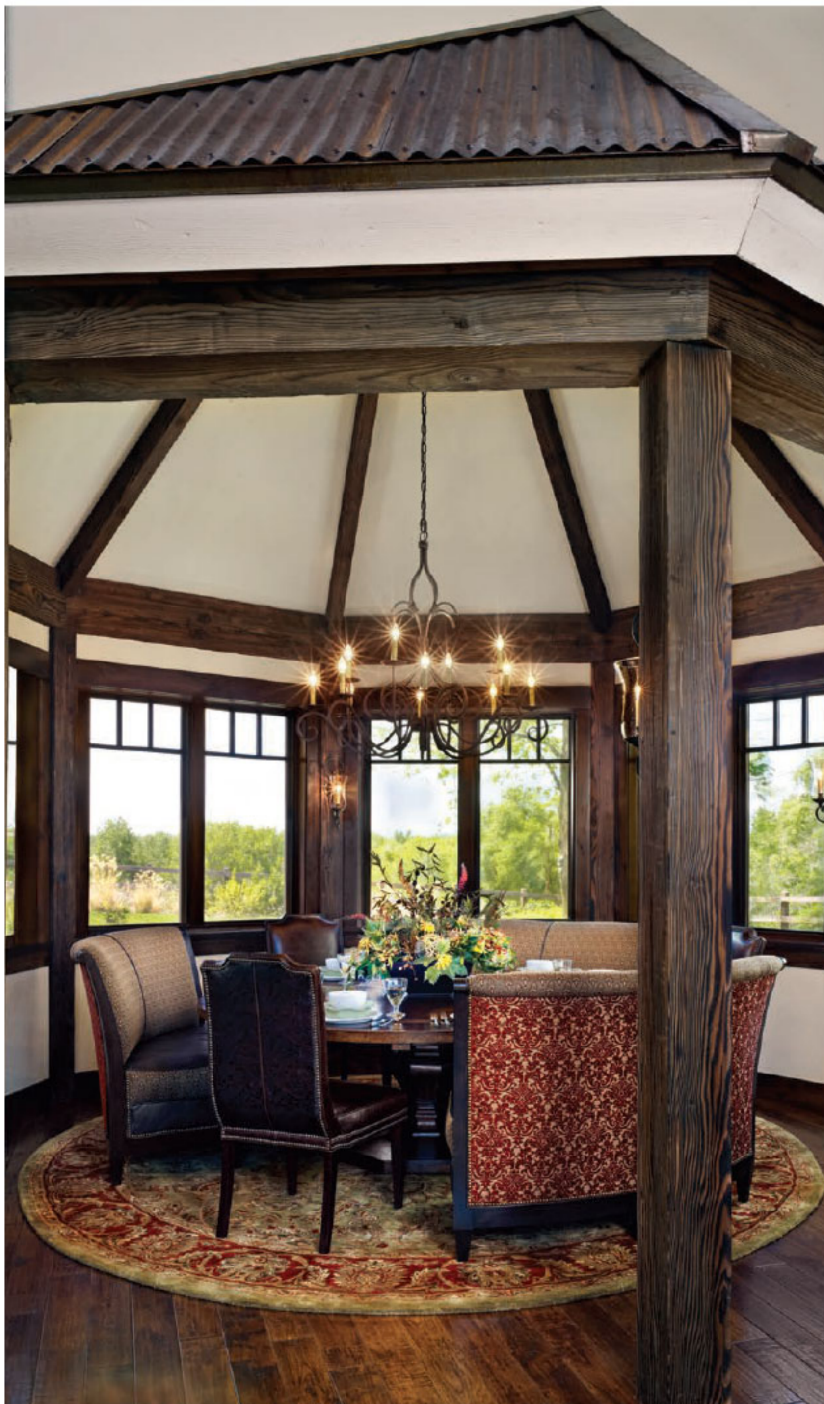
The rustic metal roofing in the interior of the home is a creative style element setting off this already interesting round dining space. Rustic beams and window trim foster the farmhouse feeling.

The everyday dining for this family happens in the kitchen and adjacent bar area. This public area of the home best expresses the homeowners' design intentions. The main kitchen area features an oversized island with a rustic celery green finish. The refrigerator/freezer is disguised as a piece of furniture with paneled doors and crown molding. Behind the range wall hides a utilitarian pantry sandwiched between two anterooms designed to offer extra storage and ample workspace. Copper sinks and farmhouse-style bronze fixtures add pops of country style, but the backsplash tile with chickens and other farm animals completes the look.